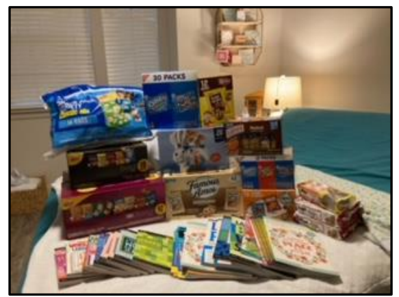
Items Donated by Members