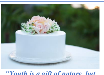
"Youth is a gift of nature, but age is a work of art!"